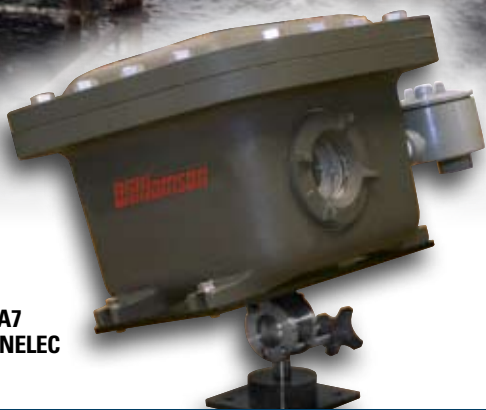
NEMA7 or CENELEC