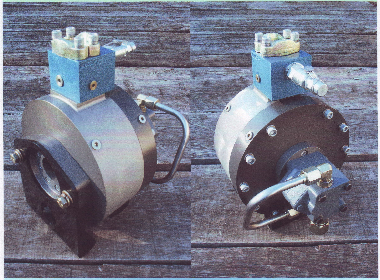
SIMPLE, RELIABLE, FLAMELESS

PREHEAT AND WARM ENGINES HEAT TO VAPORIZE LIQUIFIED GASES HEAT OILS, FUELS AND LUBRICANTS HEAT BUILDINGS, SHELTERS, AND DECKS PREVENT WATER FREEZING IN TANKS WARM AND CIRCULATE POTABLE WATER DEICE VEHICLES AND AIRCRAFT BOIL WATER/DESTROY PATHOGENS HEAT COOKING AND WASH WATER WARM HYDRAULIC SYSTEMS COOK AND HEAT FOOD