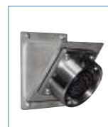
Female Receptacle with Angle Adapter 09-14090-SS + 09-2A027-SS