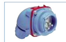
Male Inlet with Handle (Plug) 09-M8090 + 01-NA313

A typical order should include an inlet part number, a receptacle part number AND the matching handles, angles or other required accessories.