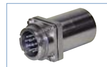
Male Inlet with Handle (Plug) 09-18090-SS + 09-2A013-SS-34

A typical order should include an inlet part number, a receptacle part number AND the matching handles, angles or other required accessories.