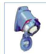
Female Receptacle with Angle Adapter 09-M4090 + 01-NA027