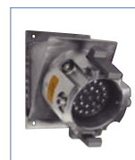
Female Receptacle with Angle Adapter 37-04130-SS + MA2SS