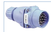
Male Inlet with Handle (Plug) 63-08220 + 61-3A013

A typical order should include an inlet part number, a receptacle part number AND the matching handles, angles or other required accessories.