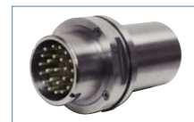
Male Inlet with Handle (Plug) 37-08130-SS + 1H1SS

A typical order should include an inlet part number, a receptacle part number AND the matching handles, angles or other required accessories.