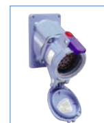
Female Receptacle with Angle Adapter 63-04220 + 61-3A027